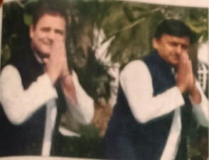
Uttar Pradesh chief minister Akhilesh Yadav (right) with Congress vice-president Rahul Gandhi during a joint press conference in Lucknow on Saturday.

By Delhi, Feb 12 Faded glories in the manifestos of political parties are being promised even as loan waivers remain the mainstay of the electioneering. Taking a leaf out of populist schemes from the ruling Bharatiya Janata Party has prompted progressive socialists to demand the poor and give milk for students learning expanding benefits under different schemes to poor people.